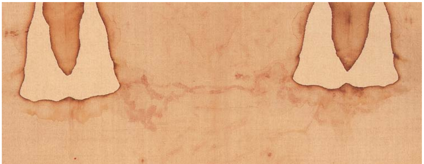
THE SMALL OF THE BACK : on the dorsal image, a transversal flow of blood comes from the lower cave vein (on the left for the reader), by the Wound of the right side, after His being lowered from the Cross and placed in a horizontal position for the burial.

« One Sunday, looking at a photograph (sic!) of Our Lord on the Cross, I was struck by the Blood which fell from one of His divine hands, and I felt great sorrow at the thought that this Blood fell to the ground with nobody hastening to collect It, and I resolved that I would stay in spirit at the foot of the Cross to receive the divine dew flowing therefrom, with the understanding that I would then have to pour it over other souls... The cry of Jesus on the Cross constantly resounded in my heart: "I thirst." Those words enkindled within me an unknown and very vivid ardour. I wanted to slake the thirst of my Beloved, and I felt myself consumed with the thirst for souls. » (St. Thérèse of the Child Jesus of the Holy Face, STORY OF A SOUL )