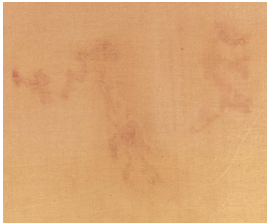
THE WOUND OF THE FEET: a single nail pierced the two feet, the one crossed over the other. That is why only the right foot marked the Shroud with a complete imprint of the sole, from which a flow of blood has spilt over onto the linen, visible on the left . The left foot ( to the right ) has only left an imprint of the heel, because the extremity of this foot rested on that of the right foot.