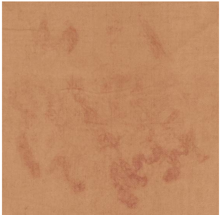
THE NAPE OF THE NECK : « On close consideration, the nape of the neck is seen to have been more tormented than the rest and the thorns more deeply embedded, with thick clots of blood matted with the hair. » (Testimony of the « Poor Clares » of Chambéry, in the year of grace 1534)

« O Jesus, allow me to tell You that You have committed follies for Your little spouse. » Thinking of all these sufferings, these dreadful pains that Jesus foresaw and premeditated throughout His life and willed out of love for her, to save her,